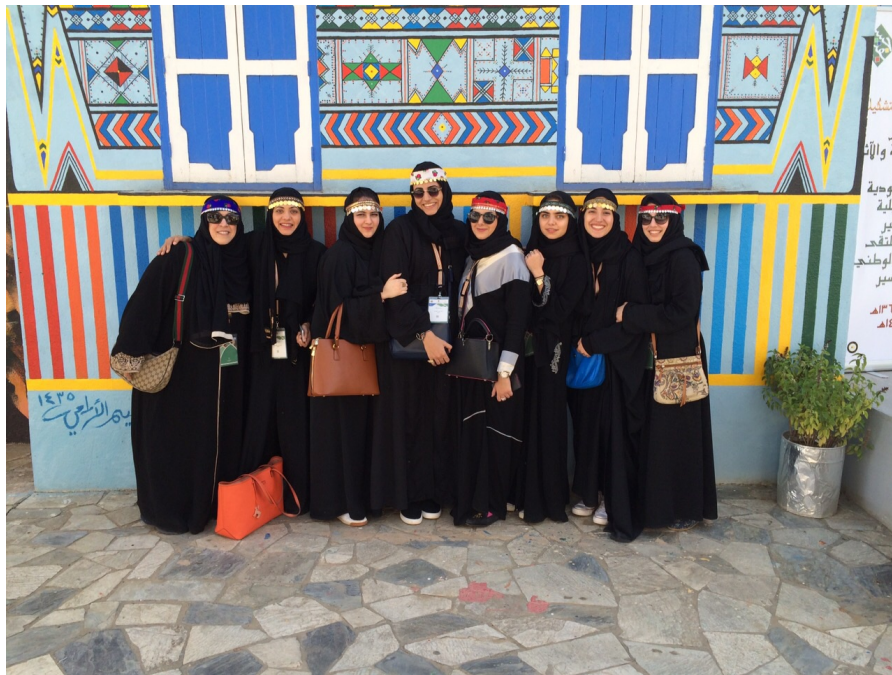
The team in Almuftaha, the art central of Abha

determination, and persistence as well as learning new skills such as project management and promotion.